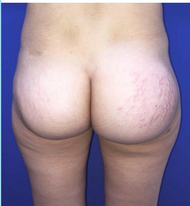
Fig. 1. Gluteal asymmetry with acute skin changes