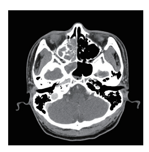
Fig. 1. Neck computed tomography image at diagnosis: heterogeneously enhancing mass lesion on the right nasoethmoidal area.

Extranodal natural killer (NK)/T-cell lymphoma is a very rare and aggressive form of non-Hodgkin's lymphoma, derived from NK cells [1]. The primary site of extranodal NK/T-cell lymphoma is the nose; however, it often extends to adjacent tissues, including the nasopharynx, paranasal sinuses, and oral cavity.