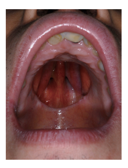
Fig. 4. Preoperative view: a 26-year-old man with a palatal defect originating from extranodal natural killer/T-cell lymphoma.

and shows good aesthetic results (Fig. 5). In follow up perceptual speech evaluations, the patient was noted to have significantly decreased hypernasality, with greatly improved speech intelligibility. Nasalance scores were 59%, which was measured with a nasometer (Model 6450, KayPENTAX, Lincoln Park, NJ, USA). A cutoff value of 63% was used; that is, nasalance scores higher than 63% were considered to indicate hypernasality.