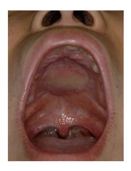
Fig. 5. Postoperative 2 years view.

Extranodal NK/T-cell lymphoma is known as a rare form of non-Hodgkin's lymphoma. Patients' subjective symptoms are non-specific, such as nasal obstruction or purulent nasal discharge. These findings are easy to misdiagnose as chronic sinusitis, or they result in a delayed diagnosis. Diagnosis of extranodal NK/T-cell lymphoma is confirmed by histologic and immunohistochemistry analysis. Immunohistochemical staining demonstrates positive reactions to NK cell marker CD56 and a negative reaction to CD3, which meet the description of markers positive for extranodal NK/T-cell lymphoma [3]. Extranodal NK/T-cell lymphoma is an aggressive malignancy with rapid progression. The 5-year overall survival rate in early stage disease is more than twice that of the advanced stage at diagnosis: 54% versus 20% [4]. Highly aggressive types involve anatomical destruction, such as septal perforation and palatal perforation. The treatment for this, combined with radiation therapy and chemotherapy, could prolong long-term survival and achieve greater local control. One month following the completion of planned