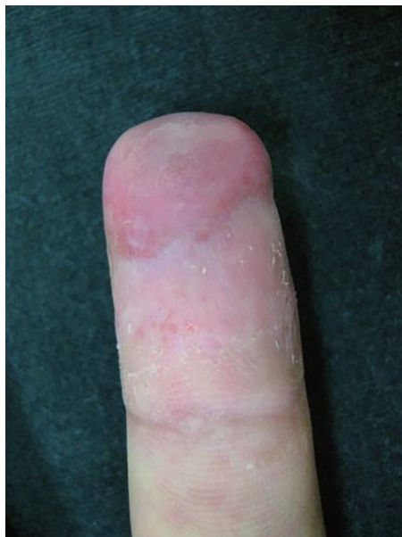
Fig. 5. A postoperative clinical photograph. The volar aspect of the middle finger (6 weeks after replantation) is well healed.

Iliopsoas hematoma is a rare complication associated with bleeding diathesis, trauma, and anticoagulant treatment [4]. Although hemorrhage is usually unilateral, a few cases report bilateral hematoma [1,2,5]. Diagnosis is based on clinical features and imaging studies, such as ultrasonography and CT [2,5]. Contrast-enhanced CT is the most sensitive method for the confirmation of hematoma. Early diagnosis is important because early treatment results in better recovery and fewer complications [4,5]. The treatment of iliopsoas hematoma starts with conservative management, including bed rest, volume replacement, and drug discontinuation. Conservative management is usually sufficient in cases with small hematomas and mild femoral neuropathy associated with non-active bleeding [2,5]. However, for patients with severe hemorrhage and intensive neurological symptoms, surgical