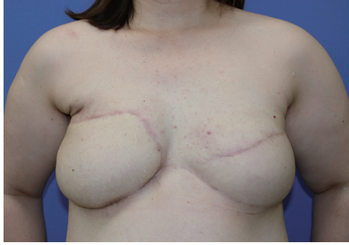
Fig. 3. Postoperative view. Six months following replacement, with an implant in the left breast.

the contralateral breast without tension. Therefore, the use of IMVs on the contralateral side can be considered as an alternative option when the ipsilateral recipient vessels are not available [2,3], and flap pedicles should be harvested with the greatest