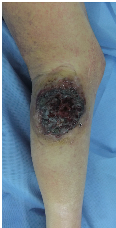
Fig. 1. Preoperative findings of a 9 cm × 8 cm purple to black protruding skin lesion with central ulceration on the upper lateral side of the right lower leg with diffuse edema.

In this article, a rare case of Stewart-Treves syndrome in the lower extremities that was misdiagnosed as a pressure ulcer is reported. A 72-year-old female was referred to the authors' clinic for the management of a protruding purple to black skin lesion with central ulceration, which developed about six months before the patient's presentation, in her right lower leg (Fig. 1). Her physical examination showed that the size of the lesion was about 9 cm × 8 cm, and there was a mild pitting edema in her right lower leg. Since the initial development of the lesion, the patient had been treated in the local clinic under the impression of